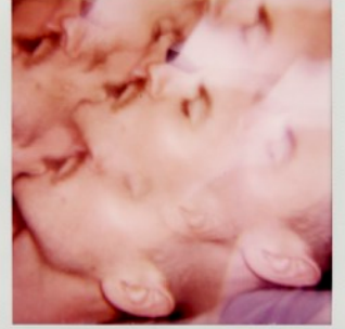
Selection of Polaroids, 2022, polaroid print (framed), 10 x 8 inches, image courtesy of the artist.

SCOPE MIAMI BEACH 2022 NOVEMBER 29 - DECEMBER 04