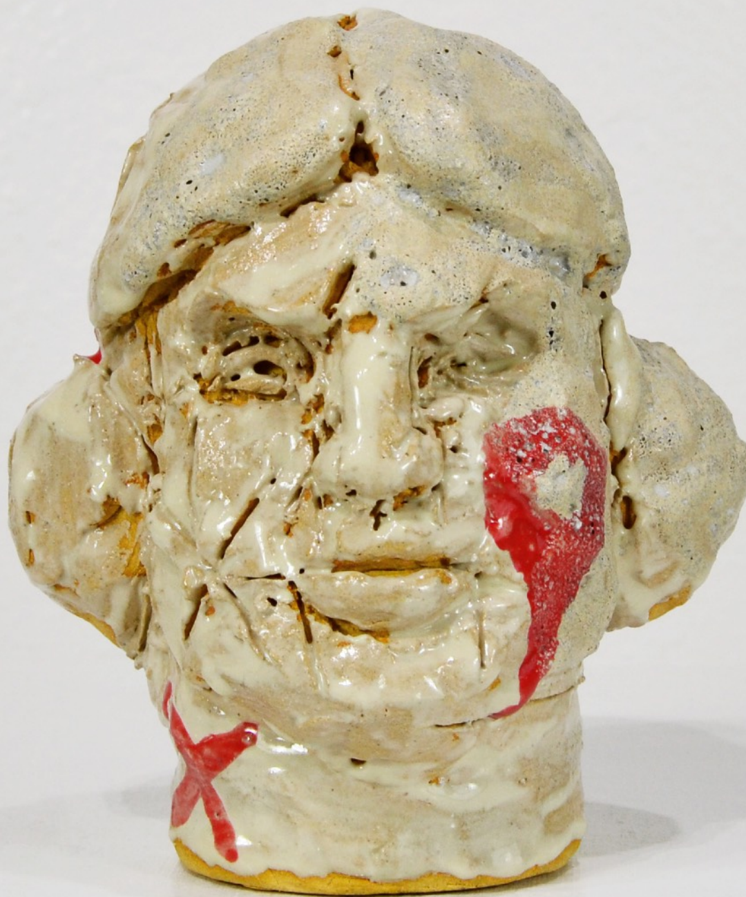
Untitled (Red), 2022, ceramic & glaze 6.5 x 5.5 x 4 inches, image courtesy of the gallery.

SCOPE MIAMI BEACH 2022 NOVEMBER 29 - DECEMBER 04