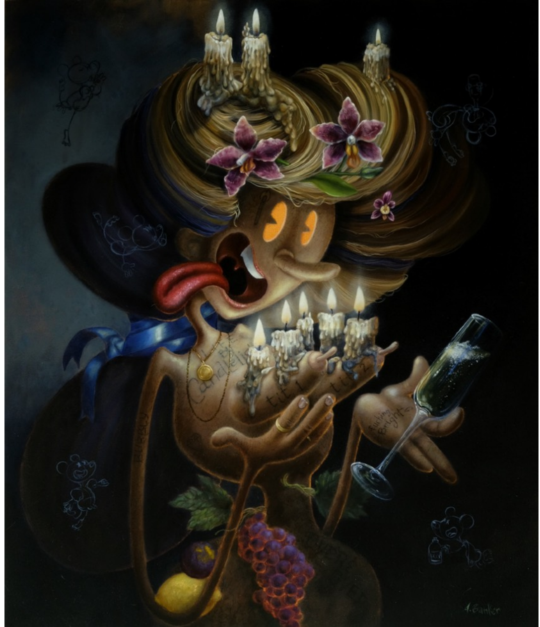
Candle Tits, 2022, oil on canvas, 28 x 24 inches, image courtesy of the artist.