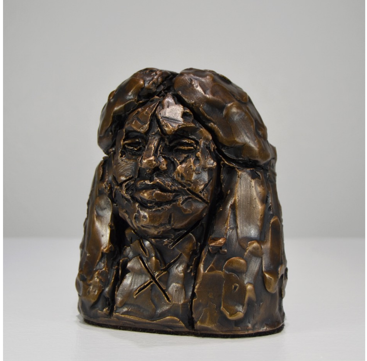
Untitled, 2022, bronze, 8 x 3.5 x 4.5 inches