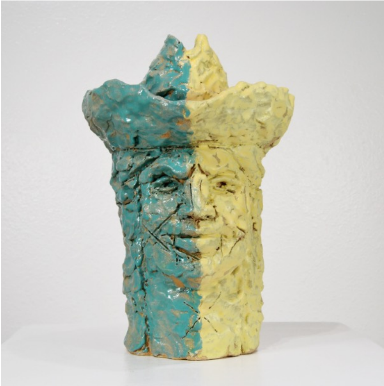
Untitled (Cowboy Hat), 2022, ceramic and glaze, 14 x 9 x 11 inches, image courtesy of the gallery.

I have focused on producing a body of work that is reflective of how I feel both as a woman and as an American Indian living in the 21st Century. In this collection, I illustrate how I feel about the ancient legacy of my Caddo tribal heritage, while at the same time acknowledging the modern day and age. Each piece is a reflection of my understanding and interpretation of Caddo culture and the fight to maintain a place for it in today's world. With the election of our current U.S. President, climate change and social oppression around the world, it is more important than ever before to have a unique voice and vision, to express it, and to make those creations seen and heard.