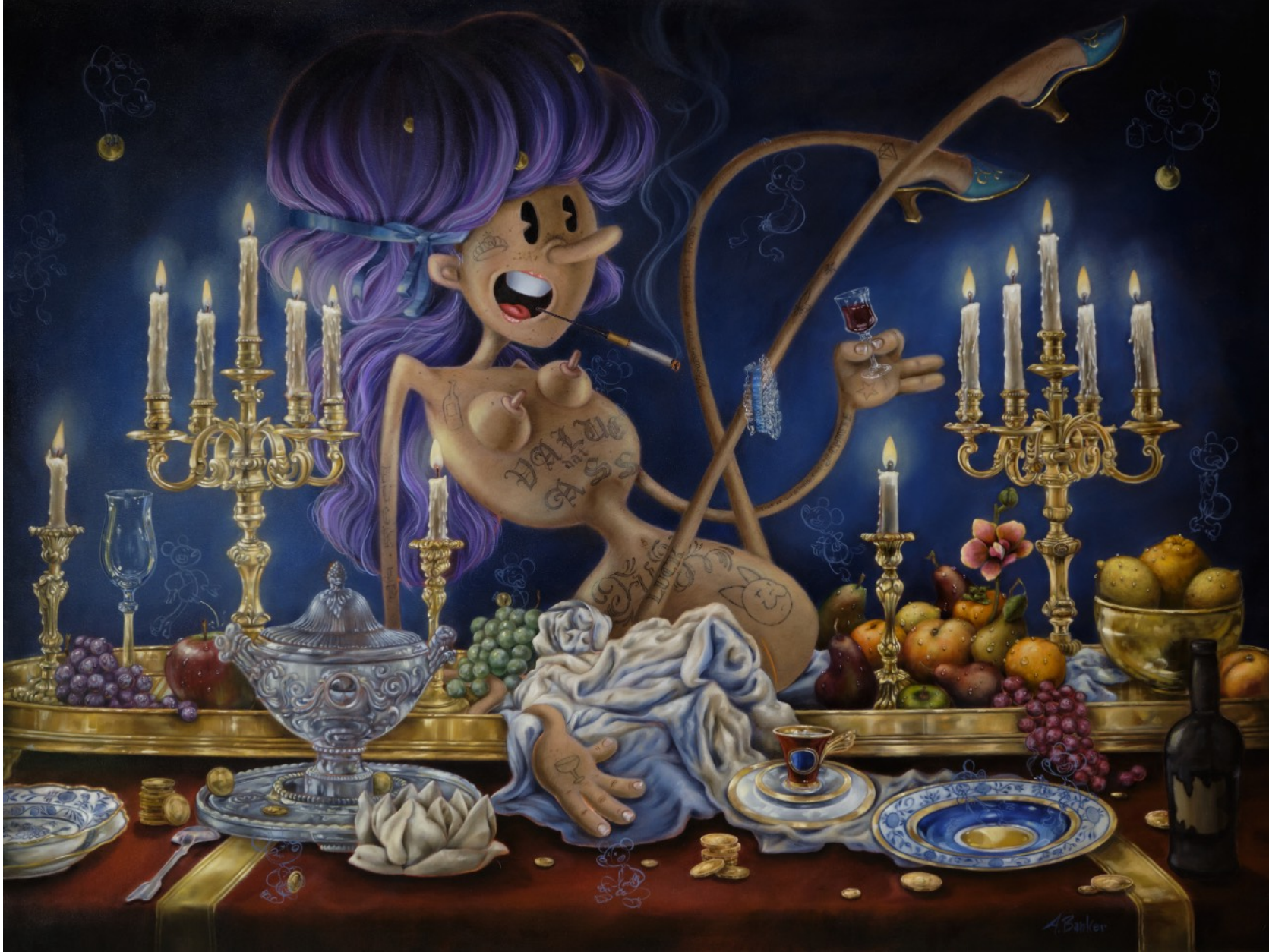
All That Glitters, 2022, oil on canvas, 36 x 48 inches, image courtesy of the artist.

SCOPE MIAMI BEACH 2022 NOVEMBER 29 - DECEMBER 04