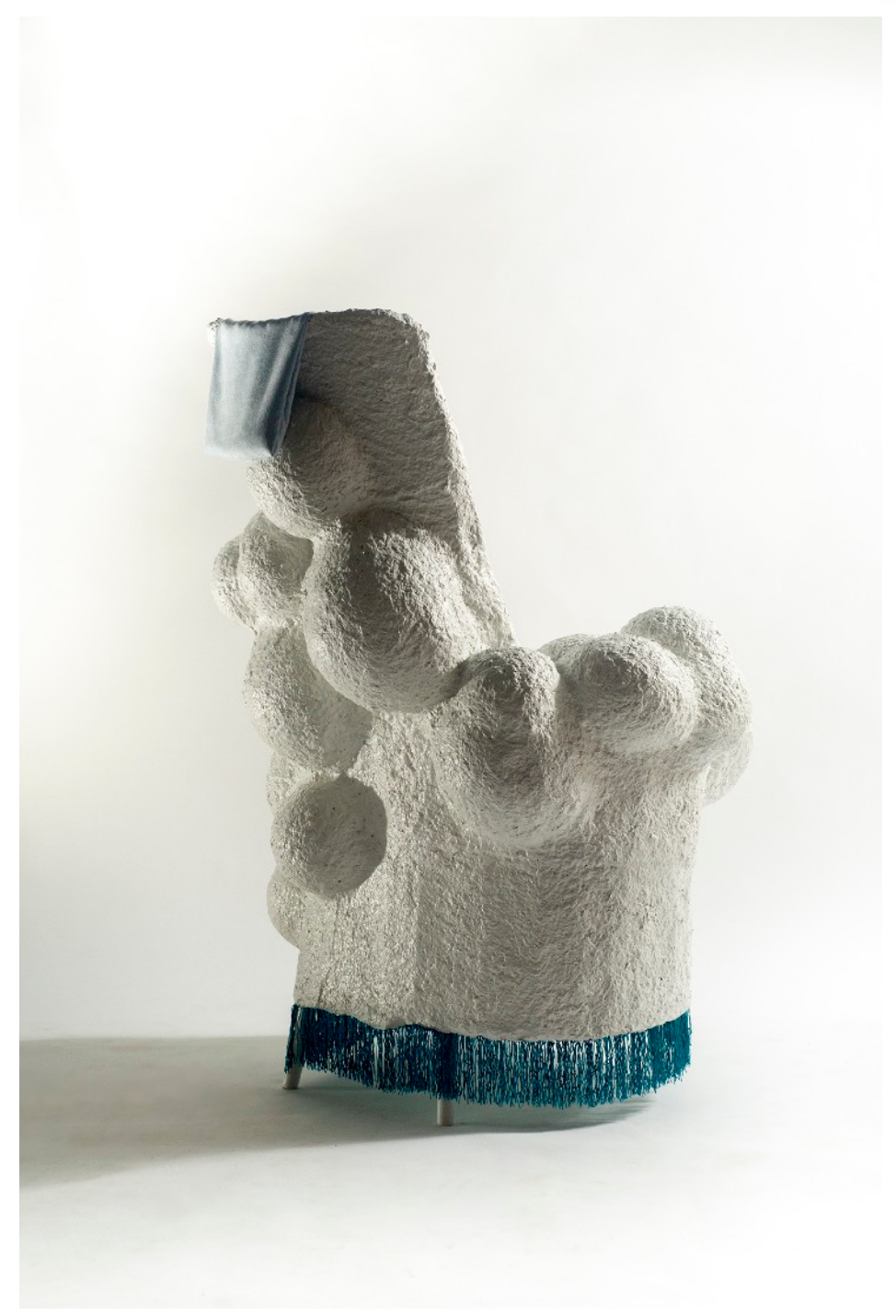
ILEANA ALARCÓN Cloud Chair (2023)

Wood, cardboard, paper-pulp, latex paint, polyurethane sealant, fringe, fabric 44 \times 25 \times 32 inches