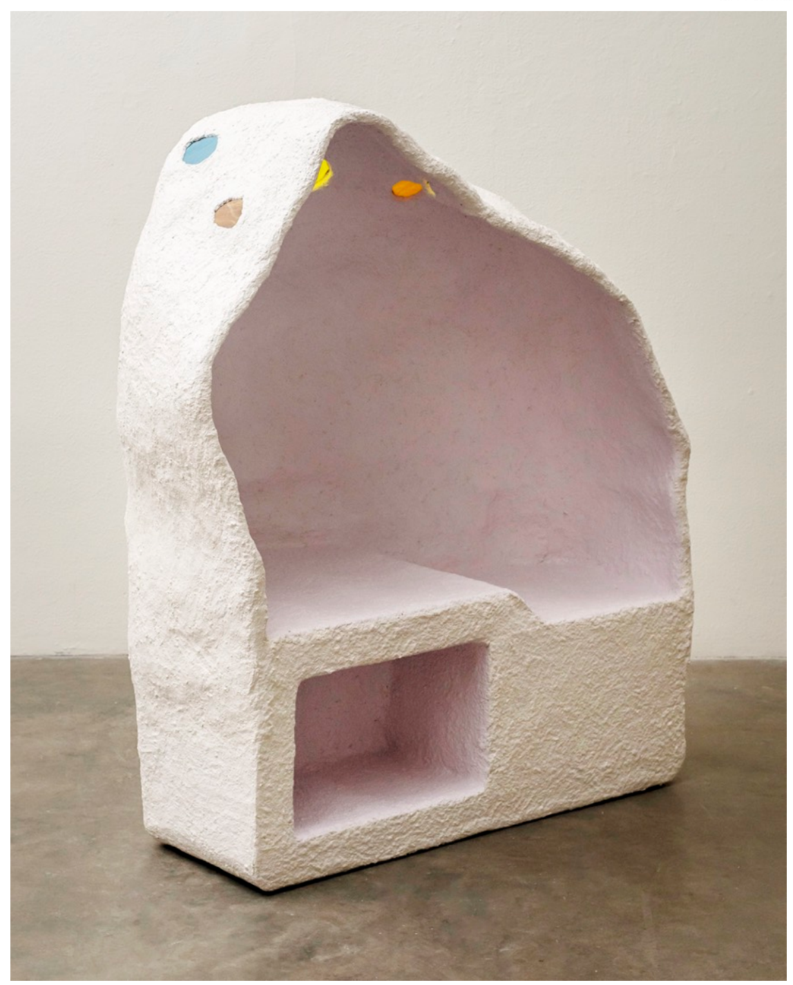
ILEANA ALARCÓN Cave Loung (2023)

Wood, cardboard, EPS foam, stained glass, paper-pulp, latex paint, polyurethane sealant 61.5 \times 54 \times 26 inches