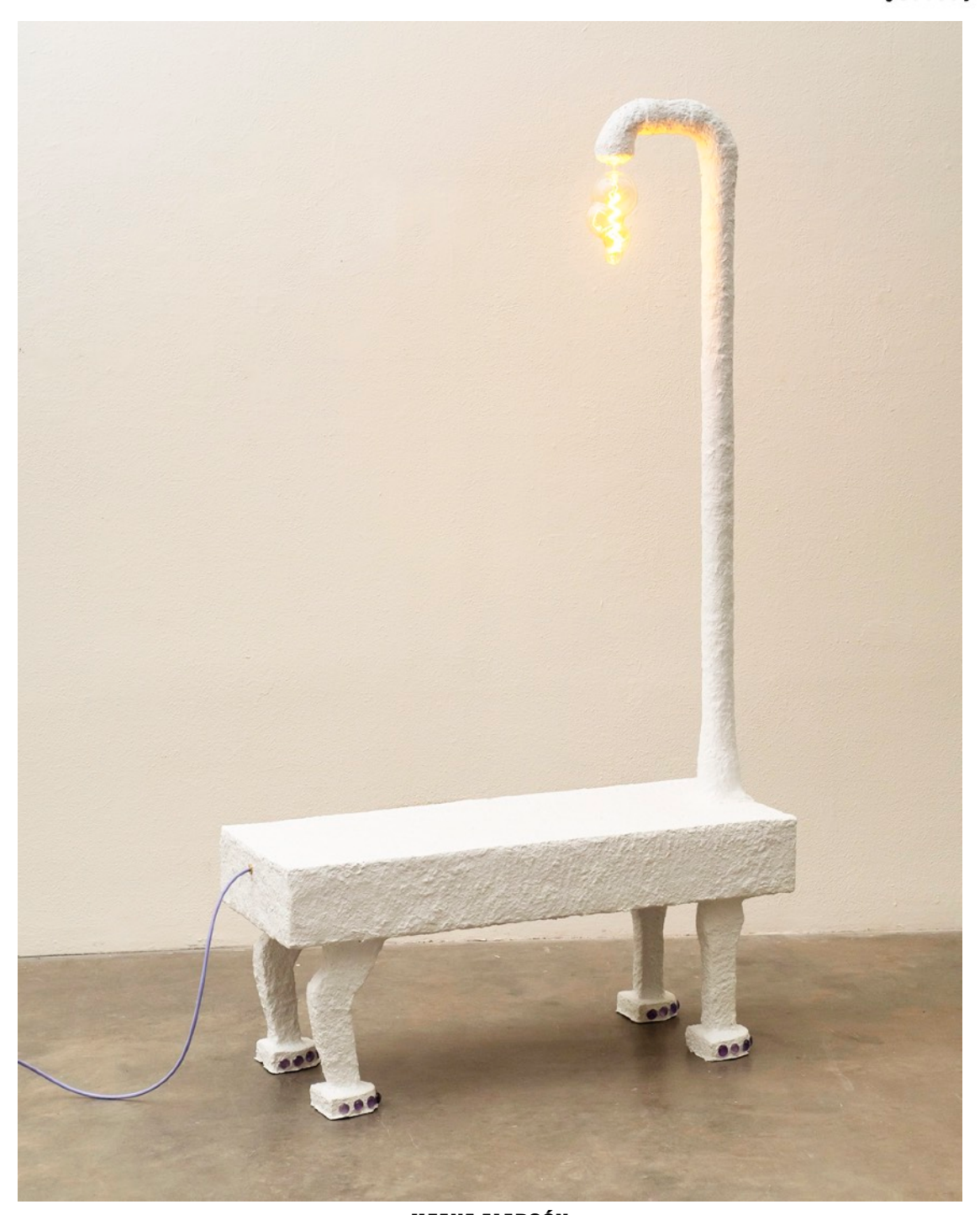
ILEANA ALARCÓN Beast Bench (2023)

Wood, LED light, PVC pipe, paper-pulp, glass stones, latex paint, polyurethane sealant 74 \times 66 \times 1.75 inches