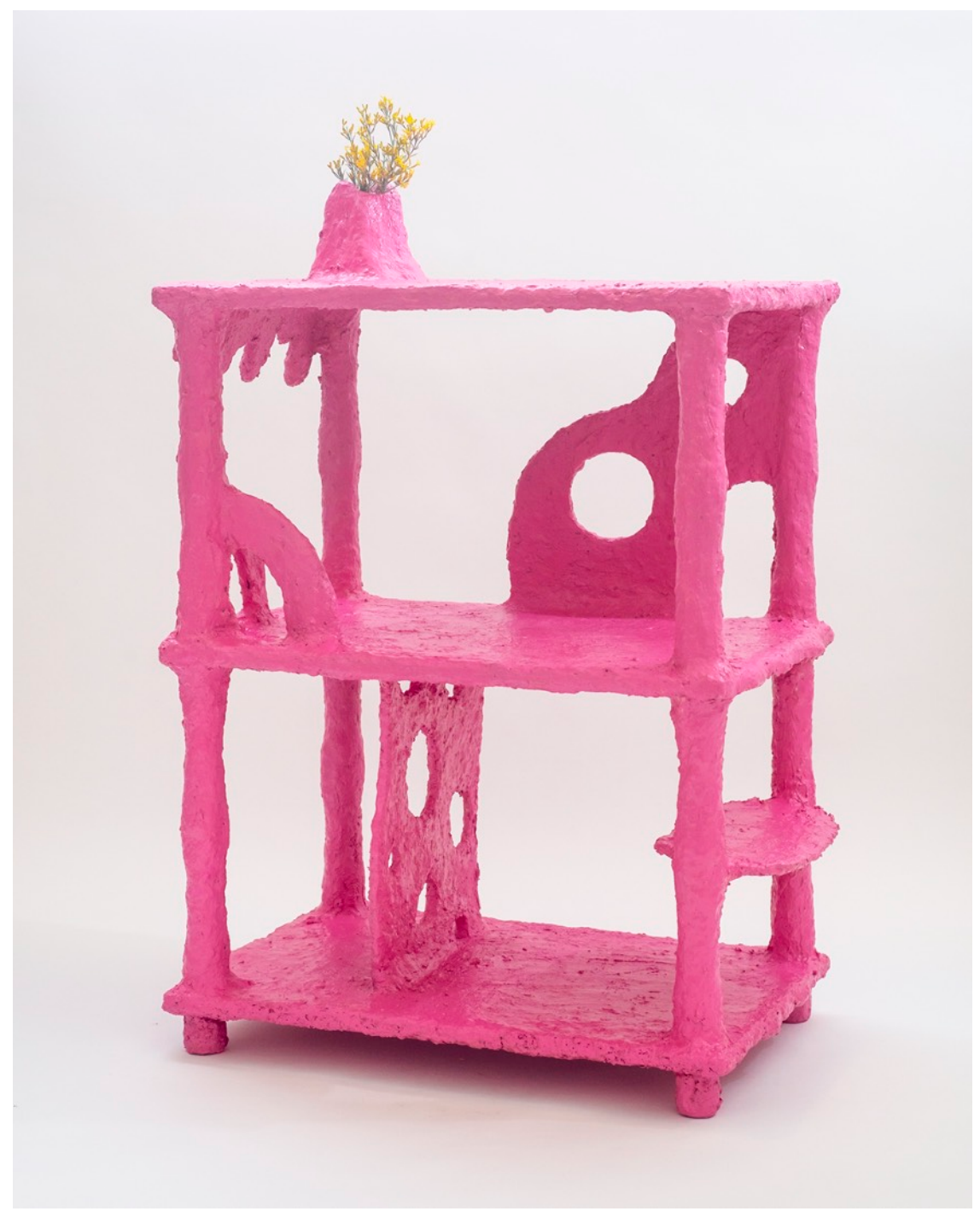
ILEANA ALARCÓN Barbie Dream Cave (2023)

Wood, cardboard, paper-pulp, latex paint, polyurethane sealant 37 \times 24.5 \times 16.5 inches